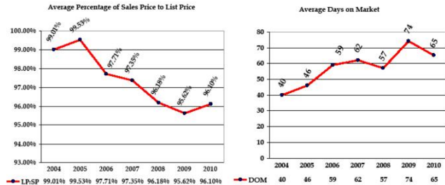
NUMBER OF UNITS SOLD EACH YEAR: